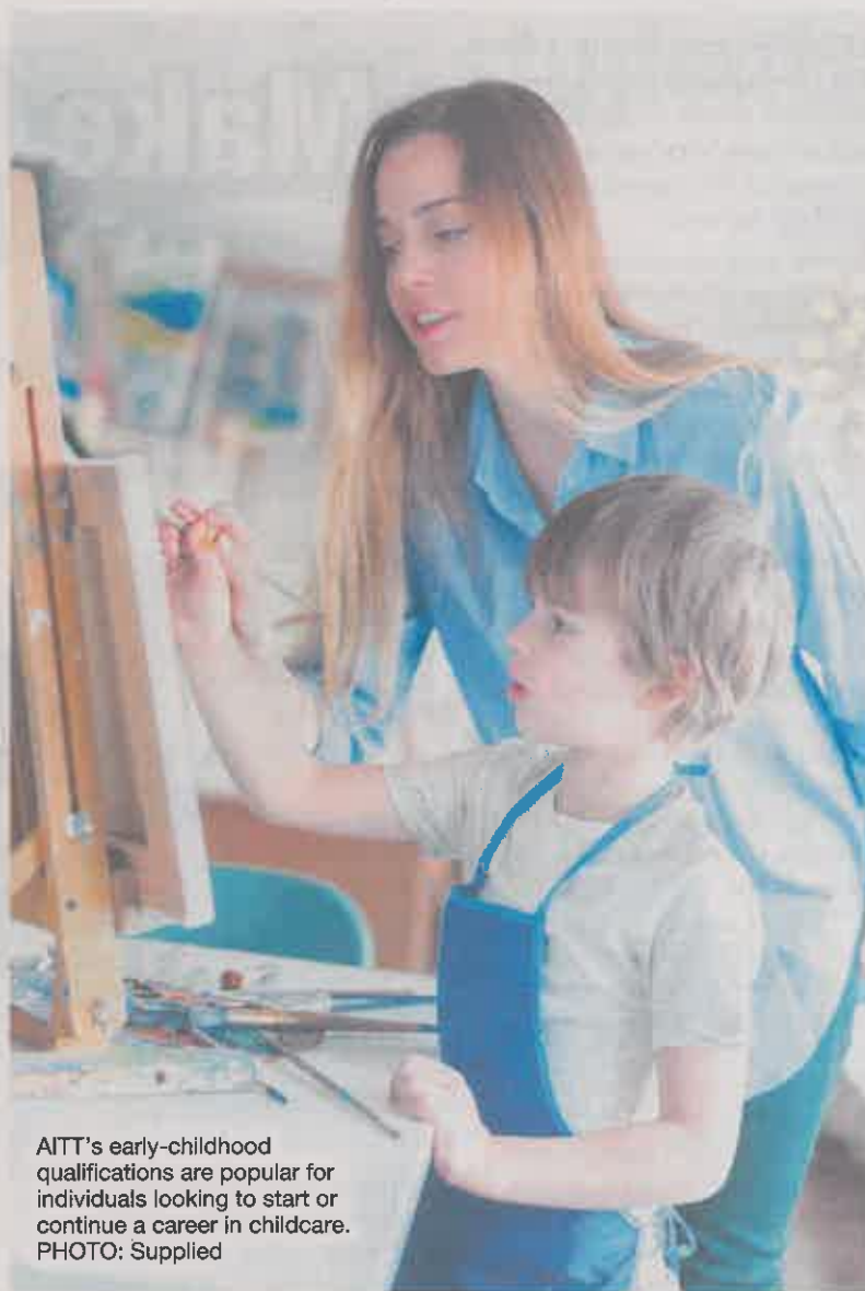
AITT's early-childhood qualifications are popular for individuals looking to start or continue a career in childcare.

AITT welcomes walk-ins so feel free to pop by the Elizabeth City Centre or CBD campus.