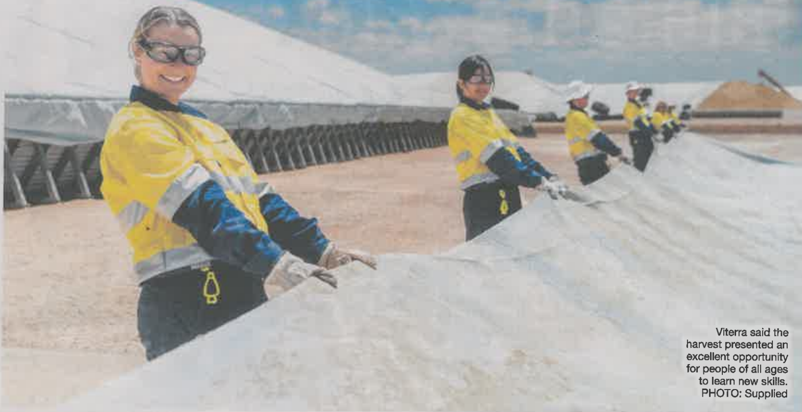
Viterra said the harvest presented an excellent opportunity for people of all ages to learn new skills.