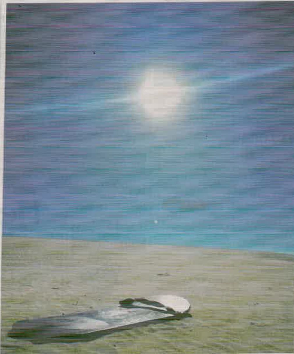
Sandboarding on the sand dunes at Fowlers Bay.