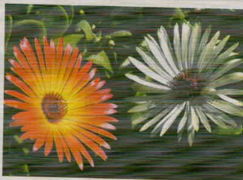
Livingstone Daisy flowers.

A message for your loved one in The Leader says so much