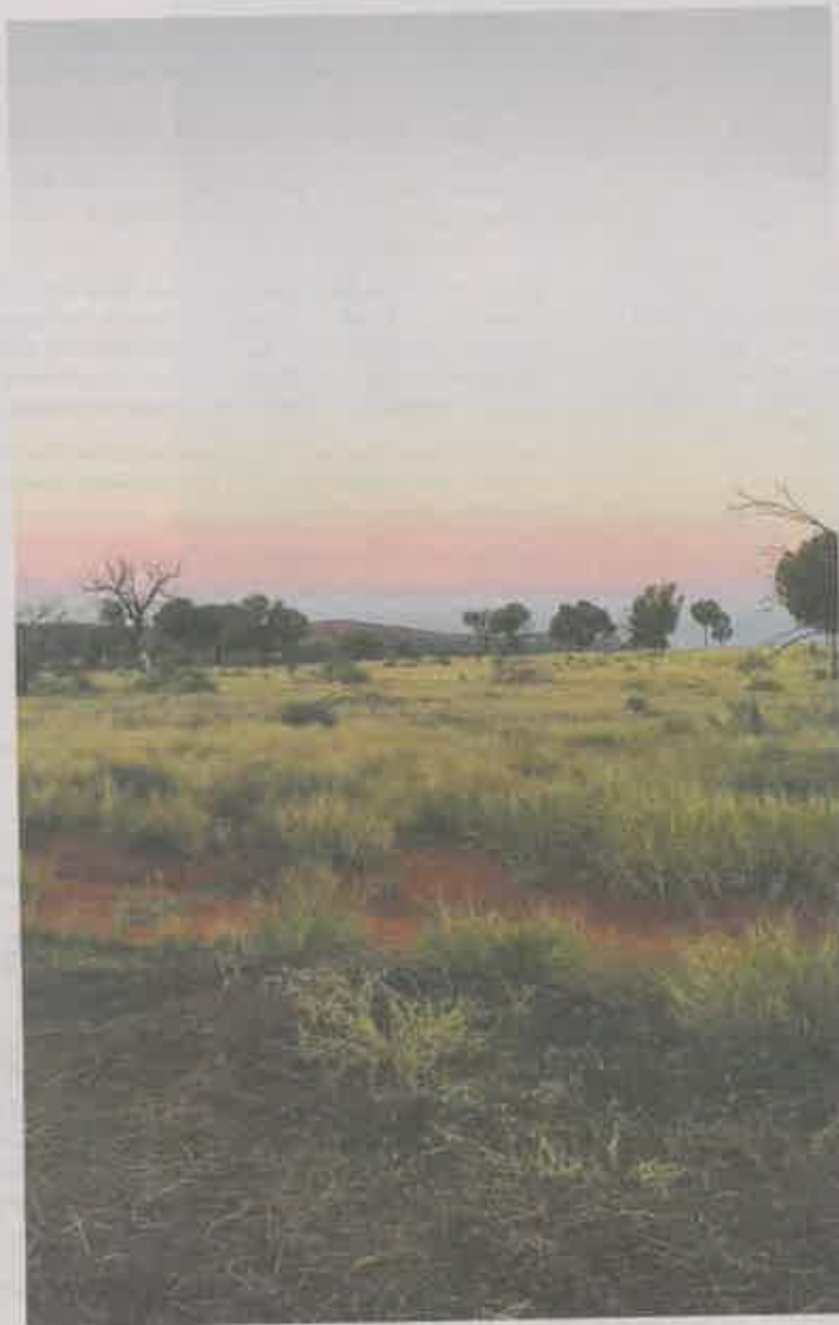
Subtle colours of the outback near Kings Canyon, NT.