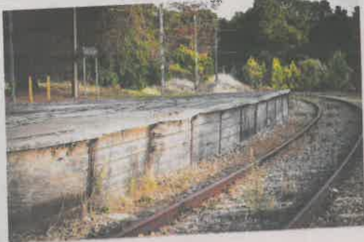
No more arrivals.