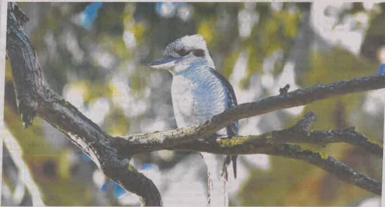
Kookaburra in a tree.