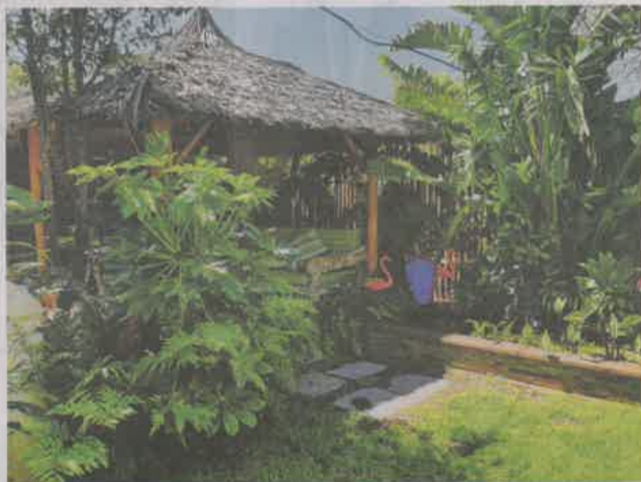
Barossa's tropical oasis

An old door at what appears to be the end of the garden opens to an area of lawn