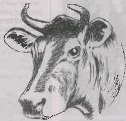
Oh no! Sale day!

For some of the farmers, sale day was the time to grab some groceries or get a haircut while in town or to pop into the pub for a couple of coldies with a mate or two.