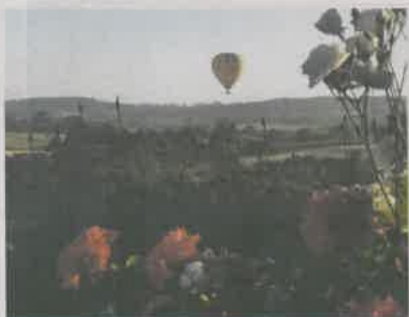
Beautiful Greenock Morning.