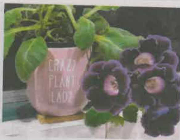
One very happy Gloxinia on a kitchen window sill.