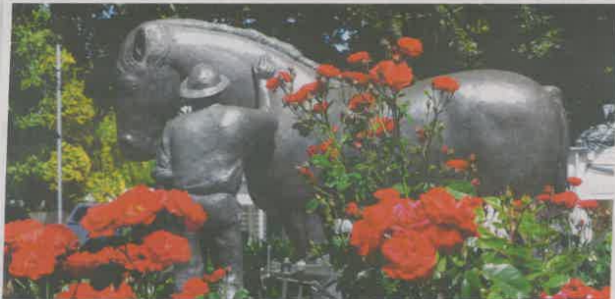
Beauty in Angaston.

Taken a great photo? Email it to leader@barossaleader.com.au with the subject 'Snapshots'. Please add a brief description, your first and last name and your home town.