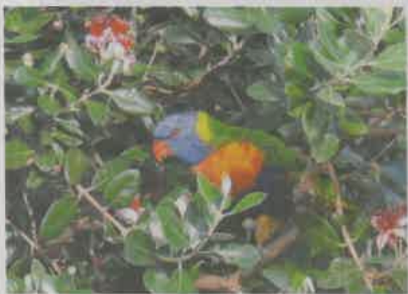
Rainbow Lorikeet eating pollen in Feijoa Tree.