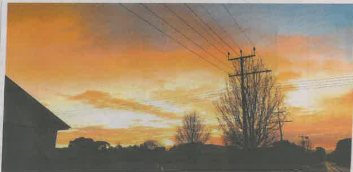
Sunrise over Freeling after a nightshift.