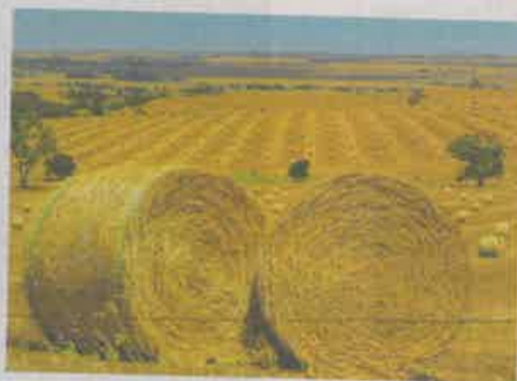
Hay bales on the Farm. Nain Hills, Barossa Valley.