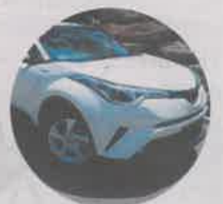
2018 Toyota C-HR

Full Service History Leather Accented Interior Sunroof