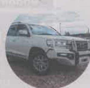
2016 Toyota LandCruiser Sahara 200

Custom Matte Black Wrap Old Man Emu Lift Kit Dual DVD Headrest Package