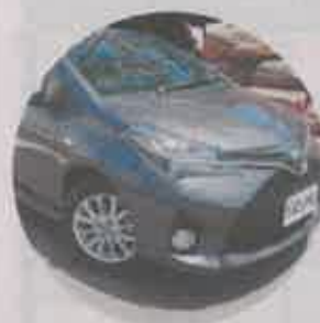
2016 Toyota Yaris ZR