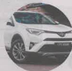
2016 Toyota RAV4 Cruiser

One Owner Great Service History Premium ZR Grade