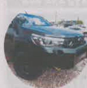
2018 Toyota HiLux Rugged X