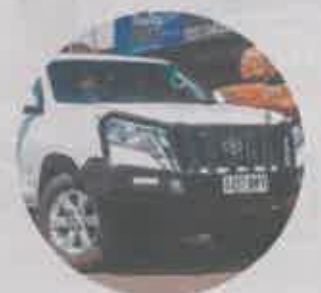
2017 Toyota LandCruiser Prado GXL

Low Kilometers Full Service History Top of the Range