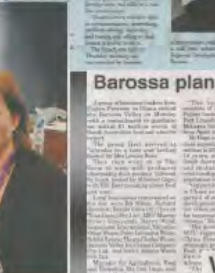
Virtual enterprise launched: A group of people standing together, possibly at a launch event.

THE Barossa Career Service is a free, confidential, and confidential service that provides career support to young people in the Barossa Valley. The service is available to young people aged 15 to 25 who are currently unemployed or have recently become unemployed. The service is provided by a team of career counsellors who are trained to provide support to young people in a variety of ways. The service is available to young people who are currently unemployed or have recently become unemployed. The service is provided by a team of career counsellors who are trained to provide support to young people in a variety of ways.