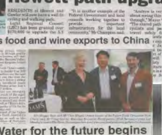
Hewett path upgr: A group of people standing together, possibly at a launch event.

THE Barossa Career Service is a free, confidential, and confidential service that provides career support to young people in the Barossa Valley. The service is available to young people aged 15 to 25 who are currently unemployed or have recently become unemployed. The service is provided by a team of career counsellors who are trained to provide support to young people in a variety of ways. The service is available to young people who are currently unemployed or have recently become unemployed. The service is provided by a team of career counsellors who are trained to provide support to young people in a variety of ways.